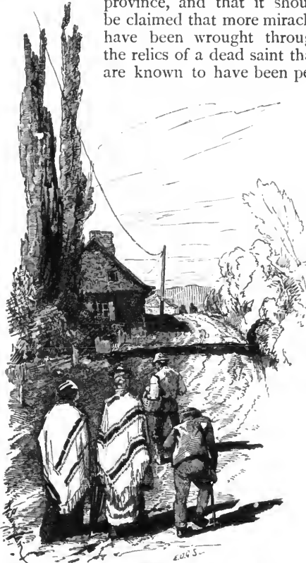
PILGRIMS ON THE CÔTE DE BEAUPRÉ.

But who was this saint so revered long ago by the Canadian voyageur and habitant, and whose intercession, all the world over, now seems to be supplanting that of all other saints? It might be enough to know that, in 1876, the Pope declared Ste. Anne to be patroness of the Province of Quebec, though it is not stated how this affects the claim of St. Joseph, who has long been the patron of all Canada. But who was Ste. Anne? Tradition says she was the mother of the Virgin Mary, born of one of the family of David, and that her mother had predicted the birth through her of the Saviour. Having died at Jerusalem, she was buried in the family vault. When you are at our Canadian shrine you may see, in a little glass case, a confused mass of dried, broken bones, which you are told are those of the saint. You will naturally be curious to know how they got out of the family vault in Jerusalem into a little hamlet in Canada. In the time of Marcus Aurelius, the infidels destroyed all the monuments in the Holy Land, but, "according to tradition," one coffin could be